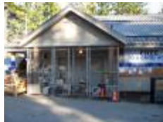
The Encorp donations are kept secured and are palletized in the new designated area.

Last fiscal year, 2007-8 the WCSS Re-Use-It Centre has processed approximately 17,788 (355,760 average lbs) donated bags of clothing and mixed goods, 2064 (30,960 lbs) pieces of small furniture, 1022 (40,880 lbs) pieces of larger furniture, 5831 (116,620 lbs) bags donated to other charities and 2851 bags to garbage. Clothing is averaged at 20 lbs per bag, small furniture 15 lbs ea, large furniture 40 lbs ea, and other at 20 lbs. This is a conservative average, as frequently bags and furniture weigh considerably more. However based on this, we can assume that the store is removing a minimum of 544,220 lbs (203,125 kg) or 203 tons of waste from the landfill