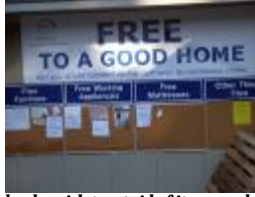
The Free bulletin boards link people who wish to get rid of items we do not accept with people who can use them!

Now unable to accept appliances, mattresses and couches, the RUI now runs a large bulletin board area that allows Whistler residents to post ads of any free items they wish to get rid of. In this manner, we hope to link people who need items with people who would otherwise take these goods to the landfill.