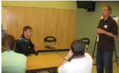
2008 Board & Staff Retreat